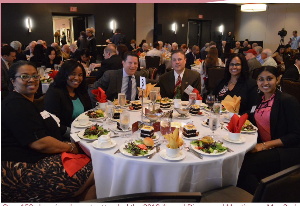
Over 150 alumni and guests attended the 2019 Annual Dinner and Meeting on May 2nd. Photo Credit: Ernesto Estremera (278)