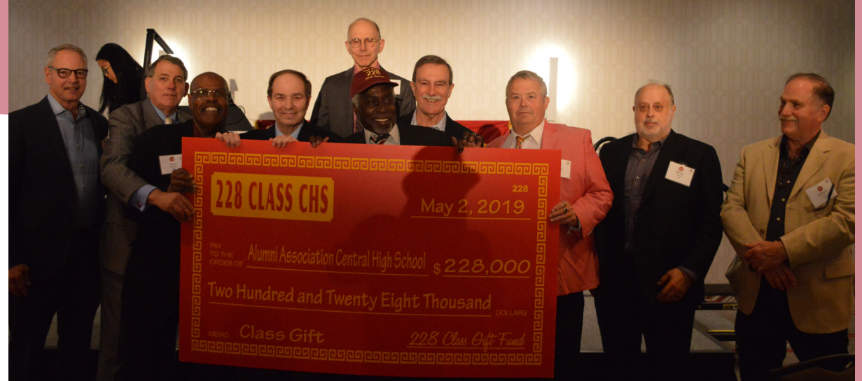
Members of the 228 present their landmark class gift to the AACHS during the dinner program.