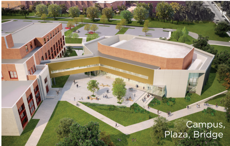
Campus, Plaza, Bridge

"I know that many Central High School graduates look back and realize how Central helped to prepare them for their careers. My hope is that many will choose to give back to Central to help fulfill the dream; I have agreed to arrange for them to be matched up to a total of $10 million."