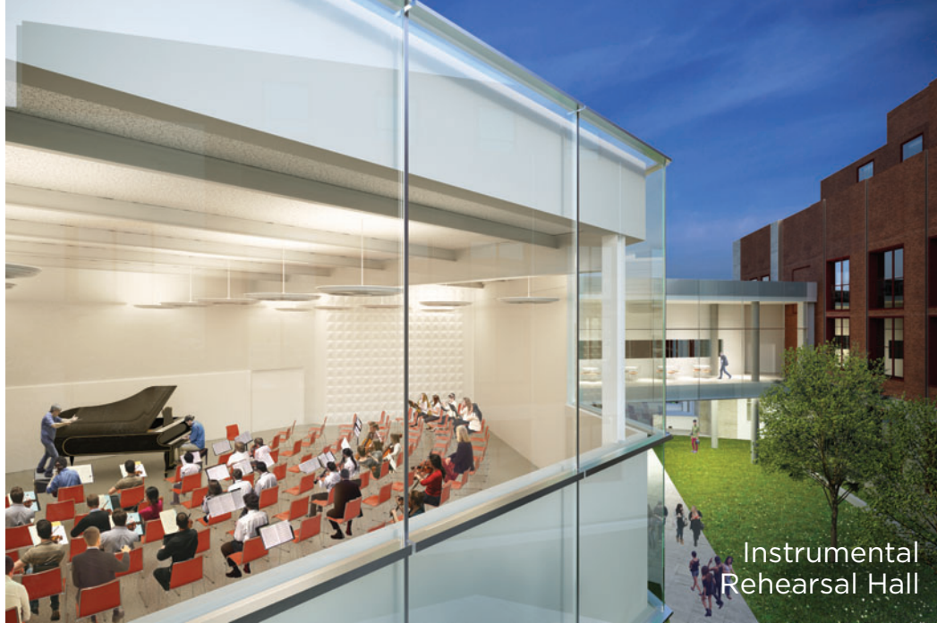
Instrumental Rehearsal Hall

The following dedication opportunities are provided for those wishing to be recognized as major donors to the Capital Campaign. Permanent donor recognition will be located in the Performing Arts Center.