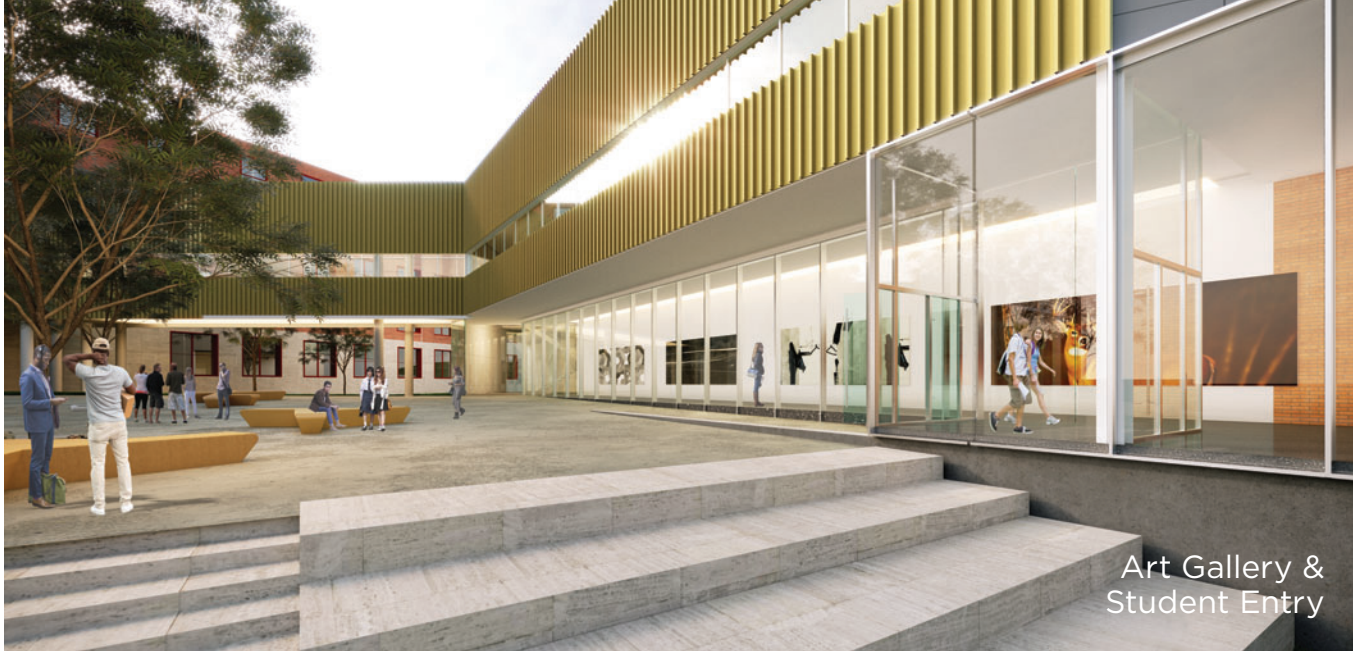
Art Gallery & Student Entry