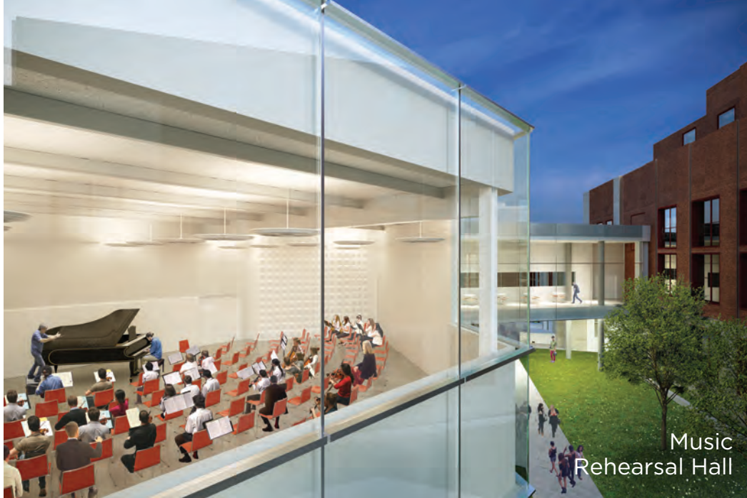
Music Rehearsal Hall

The following dedication opportunities are provided for those wishing to be recognized as major donors to the Capital Campaign. Permanent donor recognition will be located in the Performing Arts Center.