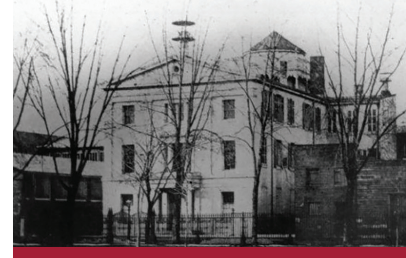
The original Central High School Building

Despite these needed improvements, much of Central's